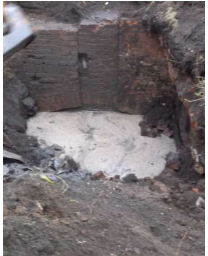
Above: inside eastern wall of cellar - note brick arch above well and lead pipe which carried water to Penwood Cottage