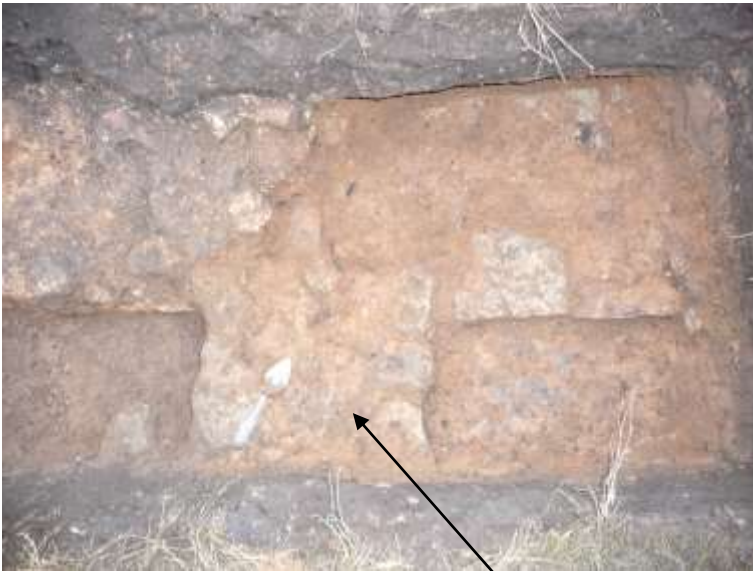
Wall of Carlton Stone joining south wall of cellar at this point

Our report of an investigation into the site of Carlton Hall has now been completed. Old maps of Hall Terrace, Penwood Cottage and the land behind them show the current line of buildings along Main Street with a larger Penwood Cottage than the present building and a second line of buildings at right angles to the road along the western edge of the site which terminate in a relatively large building.